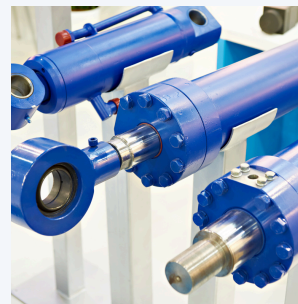
CYLINDERS, PUMPS & VALVES