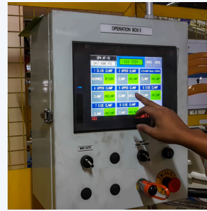
AUTOMATION AND CONTROLS