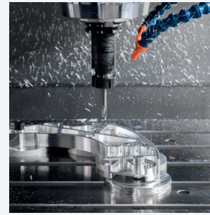
CUSTOM MACHINE WORK