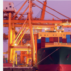
PACECO CRANE MAINTENANCE & INSPECTIONS